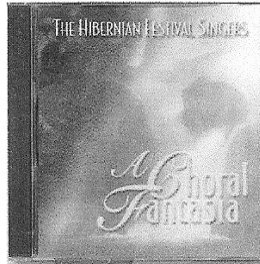
Mts Of Mourne, Lady of Knock, Ireland's Call, Minstrel Boy and more

For dates and booking information for your affair, feis, or festival call (631) 665-1371