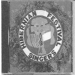
All-time favorite Irish and American Christmas tunes